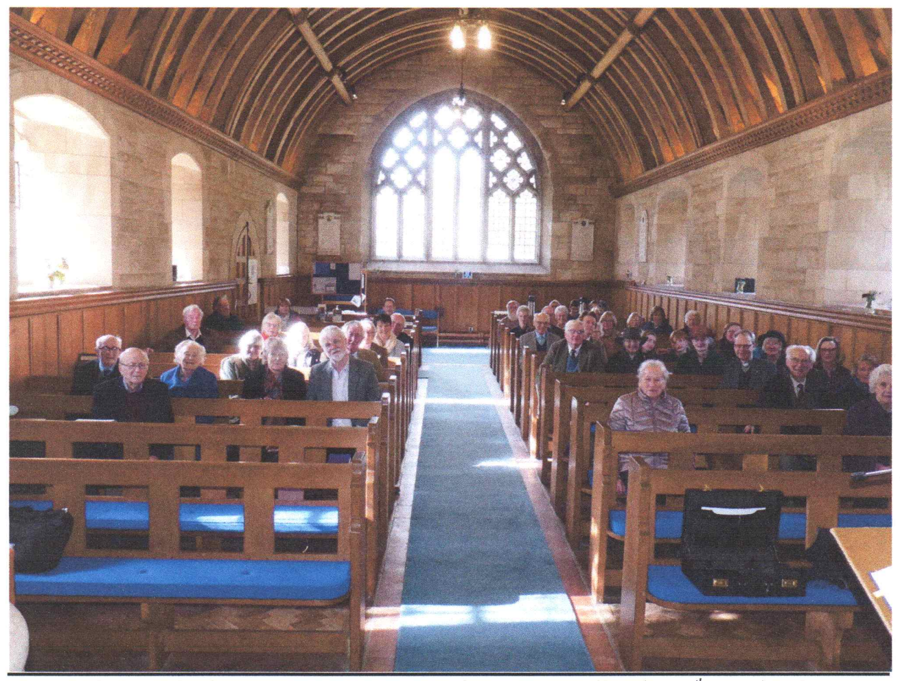
Photograph taken at a Joint Morning Worship at Fortingall Kirk on 8th March 2020

Today, we number 104 on our electoral register and around 50 worship between our two Sunday services. However, numbers are boosted during the tourist season and visitors receive a warm welcome to our services - as well as a cup of tea/coffee and a time of fellowship after the service.