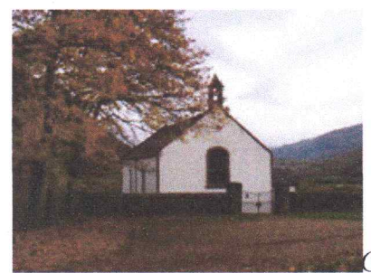
Glenlyon Church at Innerwick.