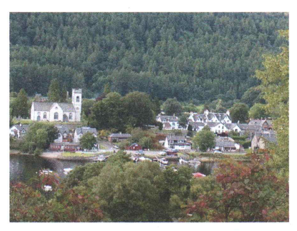
Kenmore Church sitting in the village of Kenmore