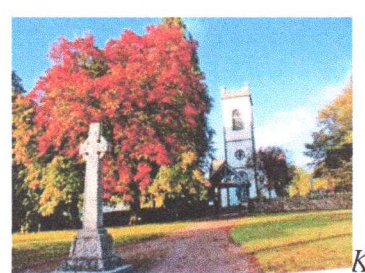
Kenmore Church in autumn