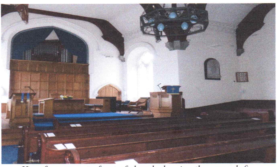
View from pews to front of church showing the organ loft